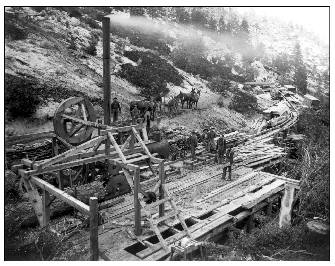
The Hansen and Park Sawmill, ca. 1907. This sawmill operated from Taylor Canyon, above Carson Valley, from 1907 through 1909.