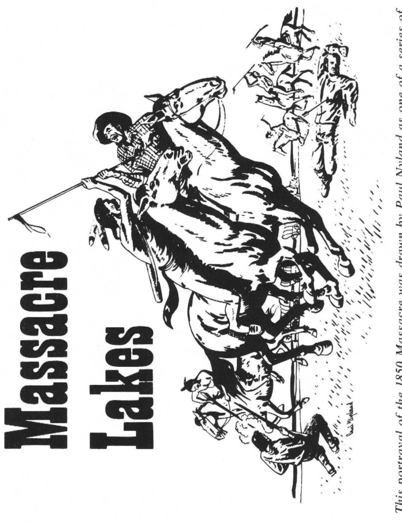
This portrayal of the 1850 Massacre was drawn by Paul Nyland as one of a series of historically oriented newspaper advertisements for Harold's Club of Reno.