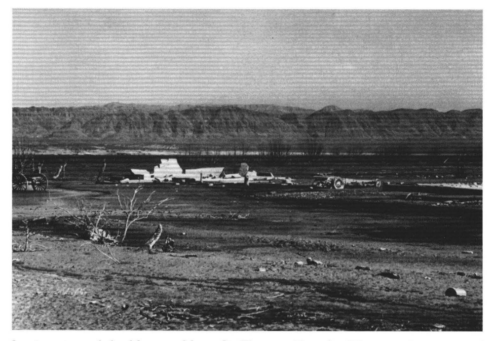
Looking toward the Mormon Mesa, St. Thomas, Nevada.

ment for the beauty and availability of the Muddy region. Disregarding the many desertions due to the harsh Muddy environment, Young lists the poor quality of roads leading to the area as the only disadvantage.<sup>24</sup>