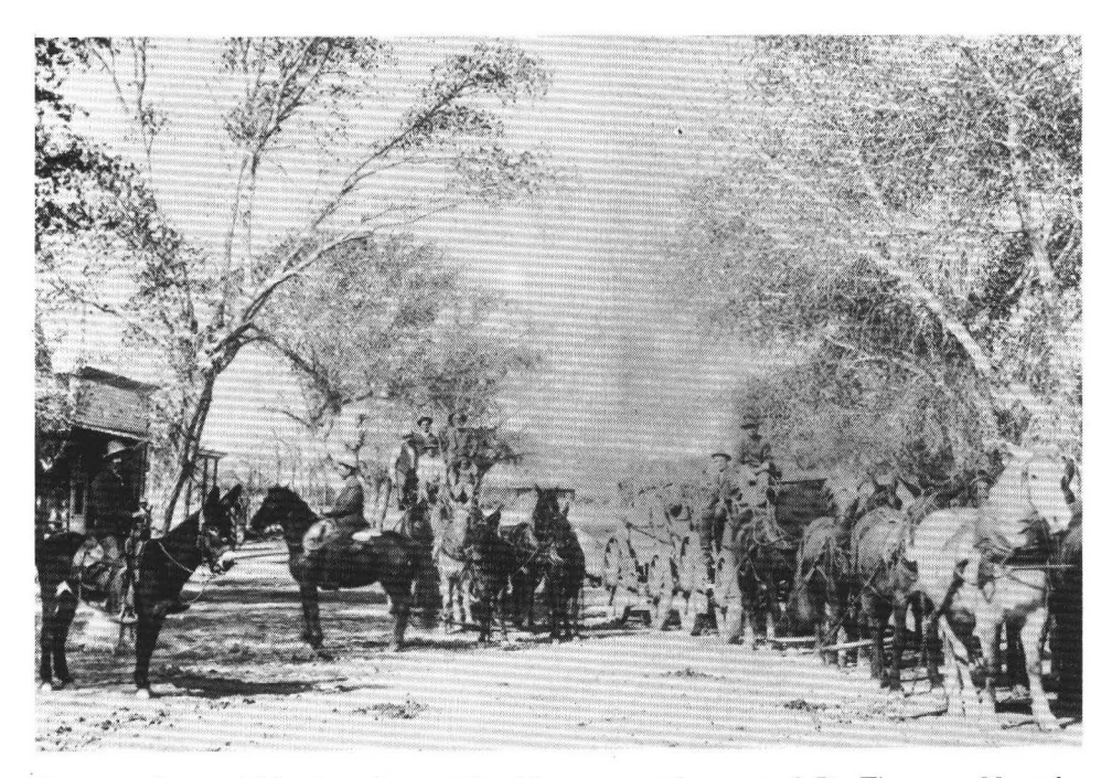
Century General Merchandise in the Mormon settlement of St. Thomas, Nevada.

On February 15, 1869, Rio Virgen County was organized by the Utah legislature, an area which would have included all the Muddy townsites. Some scholars credit this organization to a desire on the part of the Muddy residents to be governed by Utah,<sup>43</sup> although current research points to various authority figures as catalysts for this movement. Prior to this time the settlers of the Muddy region had believed themselves to be in Pahute County, Arizona Territory.